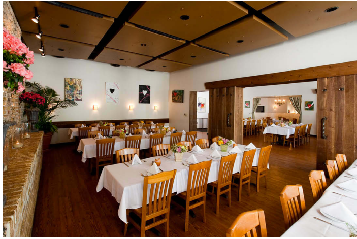
Salón la Fuente

For photographs of these dining rooms, please see www.PalomaBlanca.net .